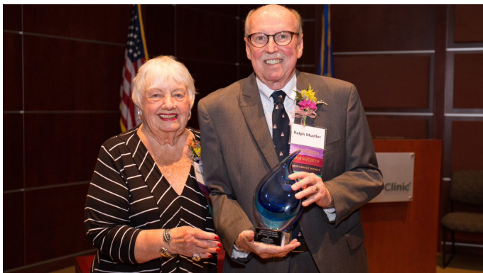
Ralph & Diane Mueller Scholarship

For a complete list of funds visit our website: www.marshfield.foundation