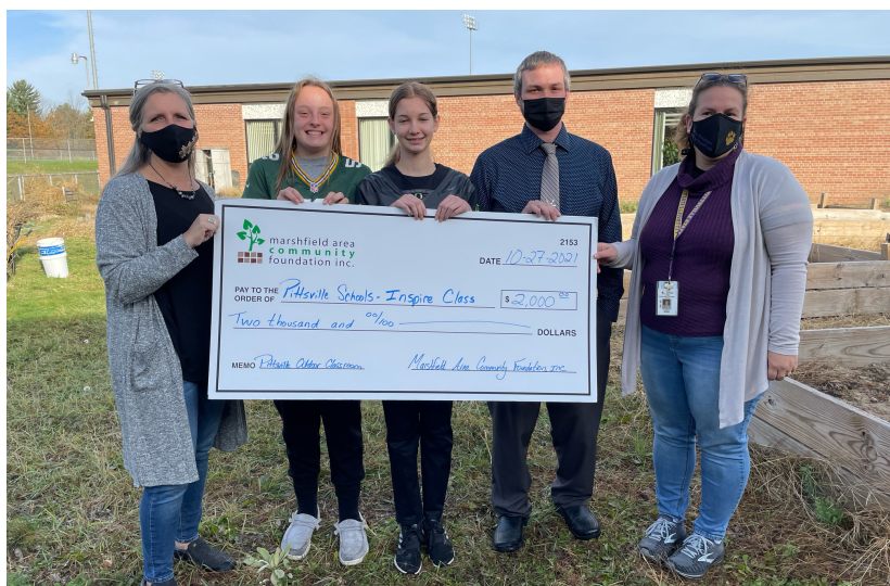
Pittsville Schools Outdoor Garden