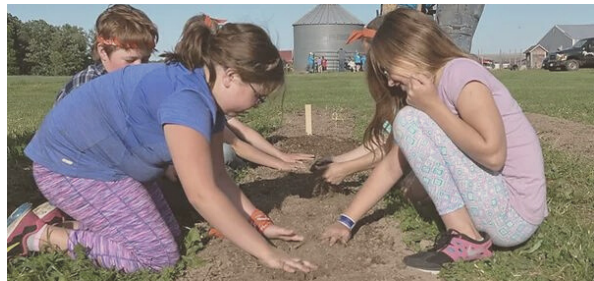
2022 Grant: Memory Lane Farms