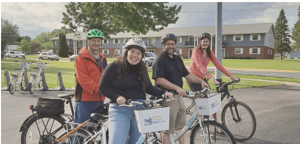
2022 Grant: Marshfield Community Bike Ride Program