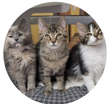
2022 Grant: M.A.P.S Spay/Neuter Program