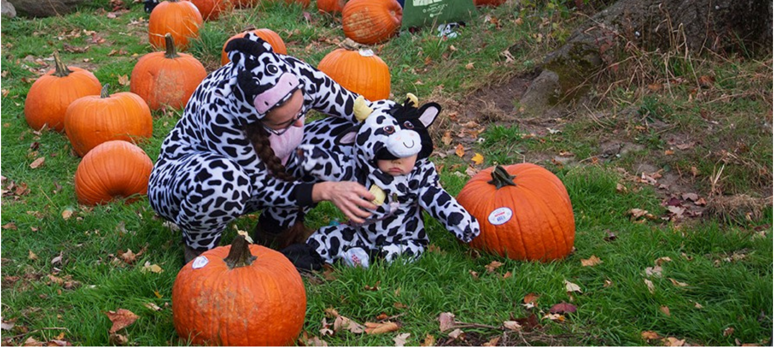
2022 Grant: Howl-oween at Wildwood Zoo event

Over $145,000 went to area nonprofits thru our Designated Funds. Donors establish a fund to benefit a specific organization each year. The spending policy is used to determine the annual donation The organization receives these funds in March of each year.