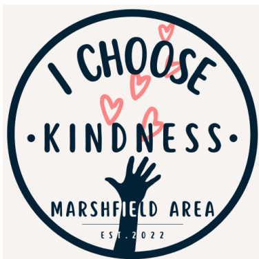
2022 Grant: United 4 Community Wellness

Over $200,000 was disbursed from our Donor Advised Funds. Donors establish a fund with a minimum of $10,000. They give input as to where a portion of their fund should be disbursed each year. An amazing impact in our community!